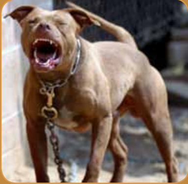
Argentinean fighting dog