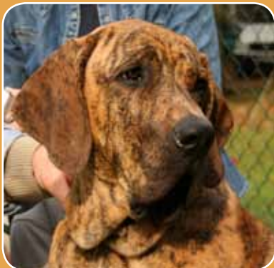
Brazilian fighting dog