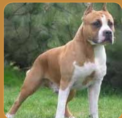
American Staffordshire terrier