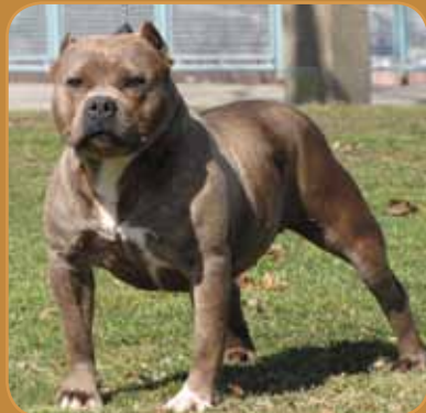
American Pit-bull terrier