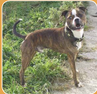
Any cross from list (1) or list (2)