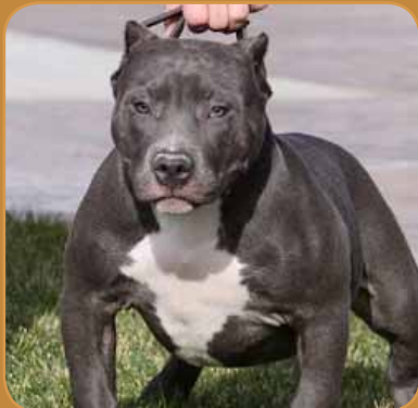
All kind of Pit-bull terrier